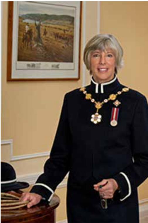
The Honourable Judith Guichon, Lieutenant Governor