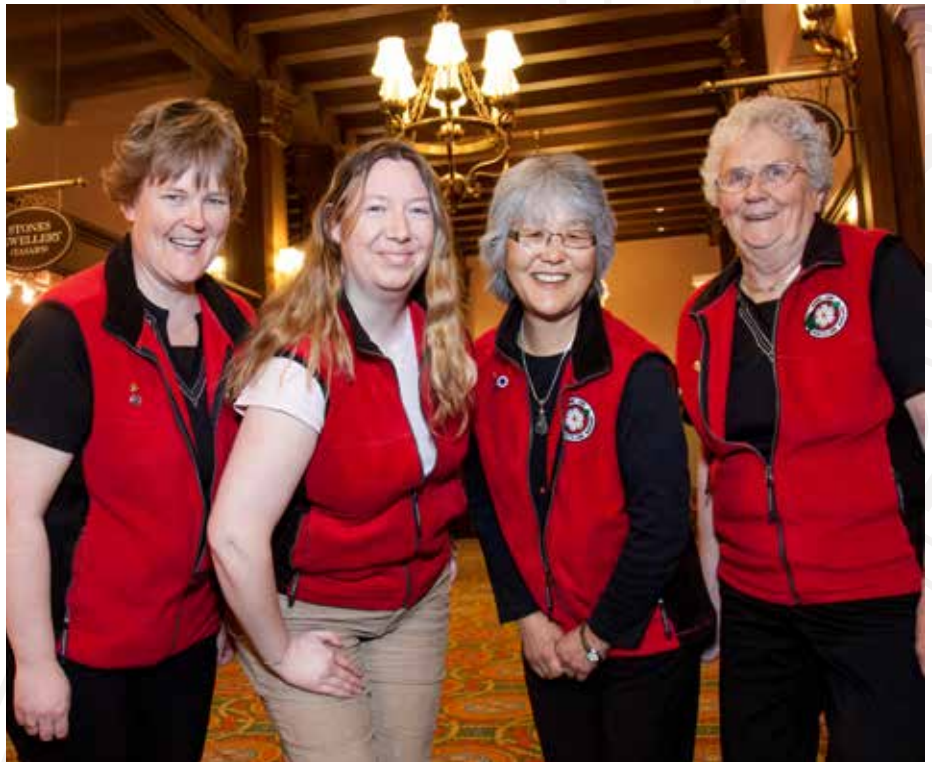
Williams Lake Delegates show team spirit