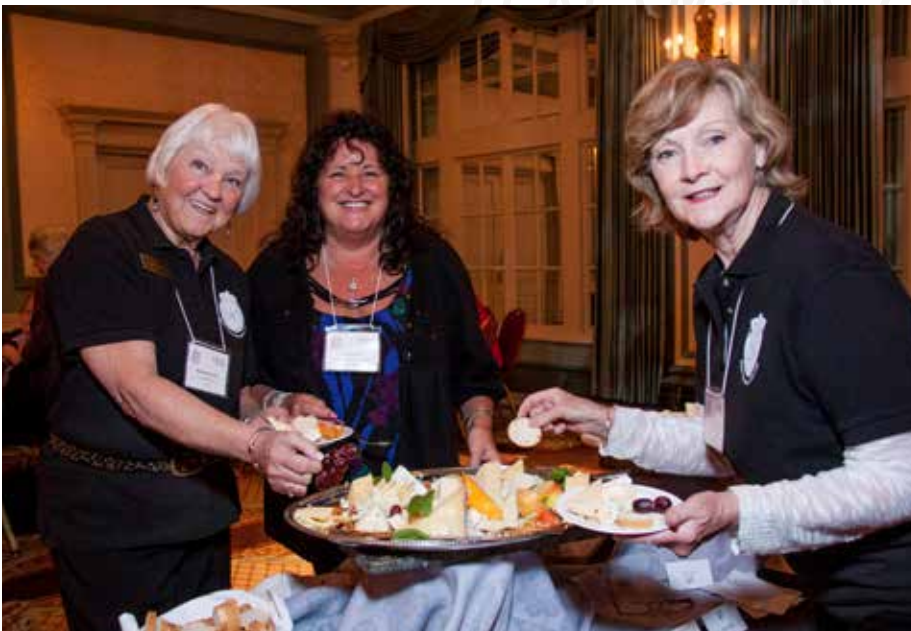
Fine food to fuel insightful ideas.